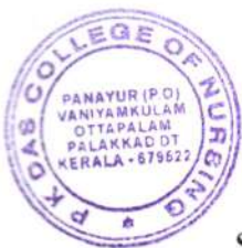
Signature of ALUMINI secretary